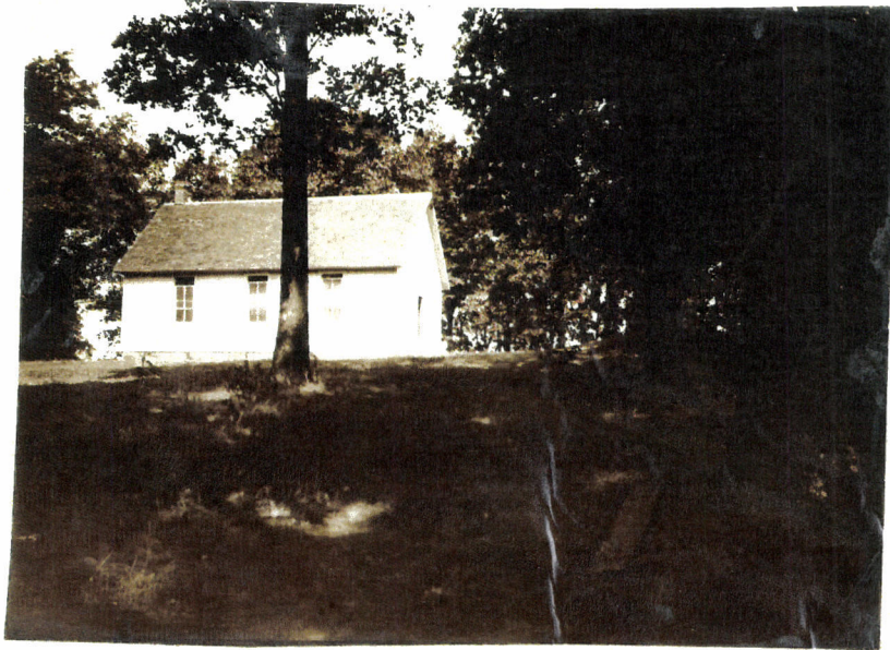
Hickory Grove, No. 102, 9-6.