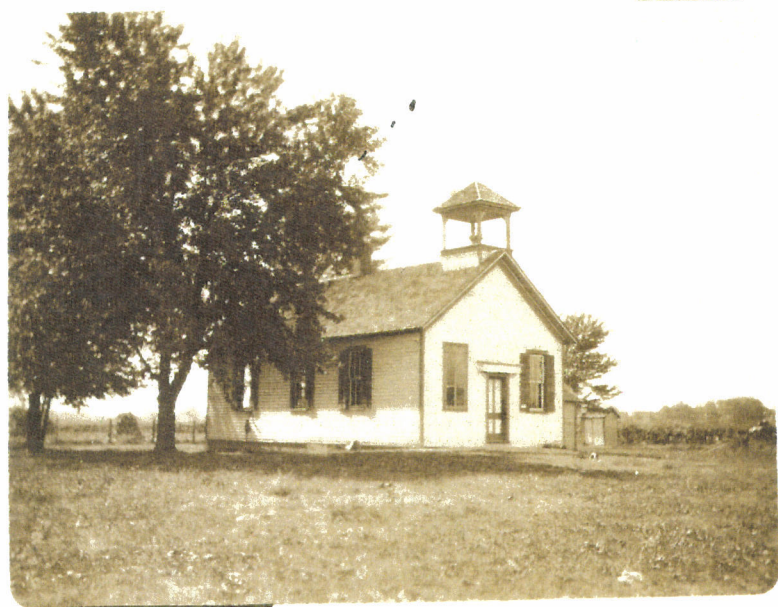
Albany, No. 121.