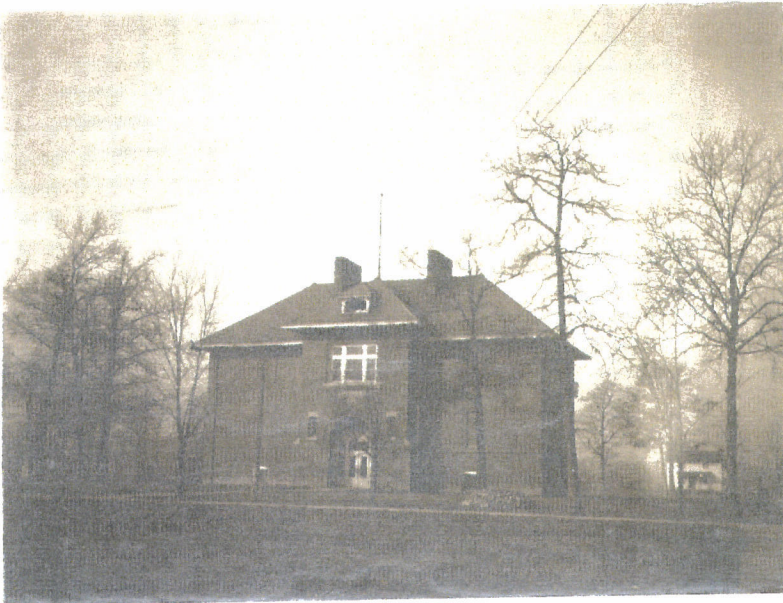
Medora No. 126, Twp. No. 8-9.