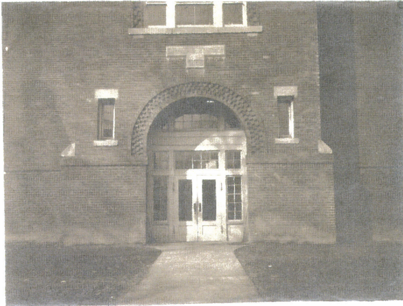
Medora No. 126, Twp. 8-9.