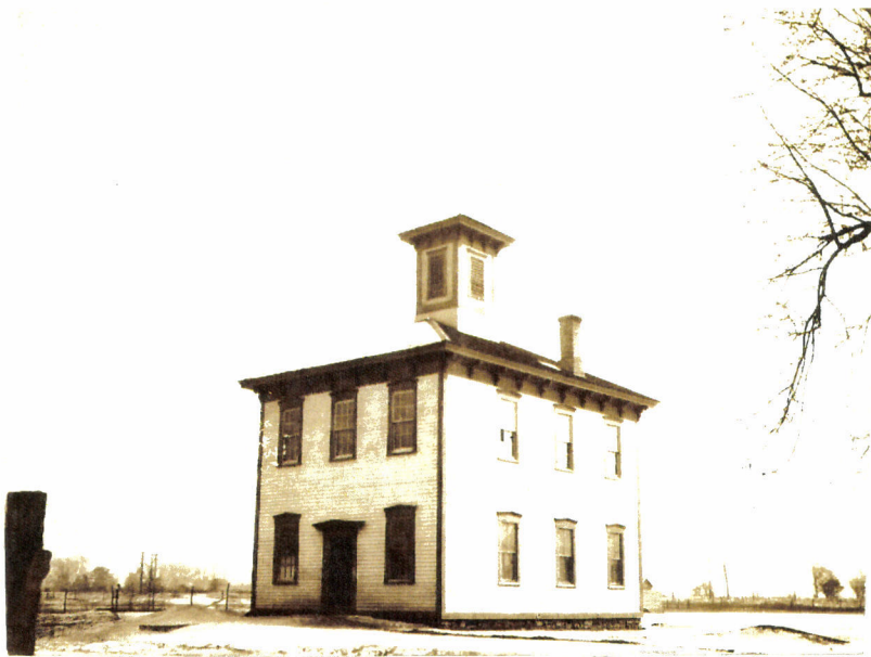
Plainview No. 145, Troop. 848, 1913.