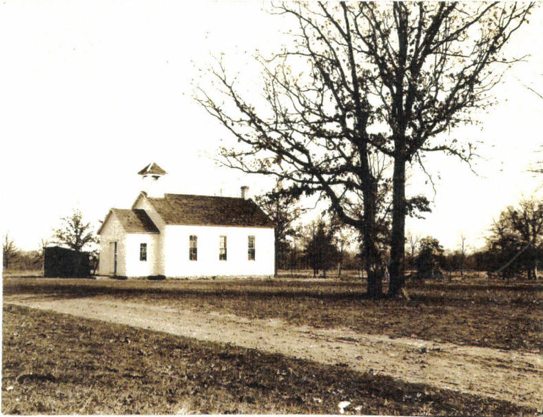
Hill Grove No. 149, Prop. 8-9.