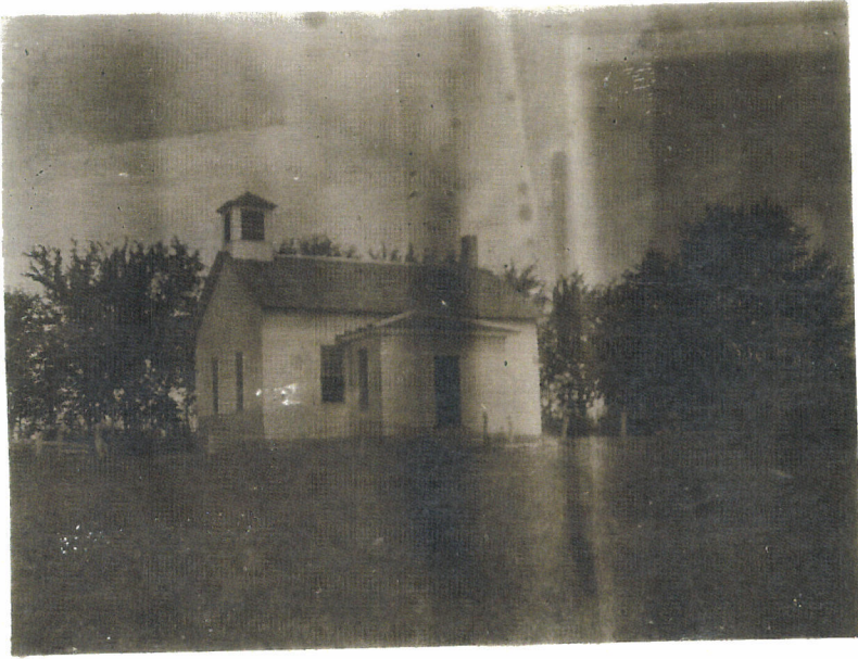
American, 15, Twp. 12-7