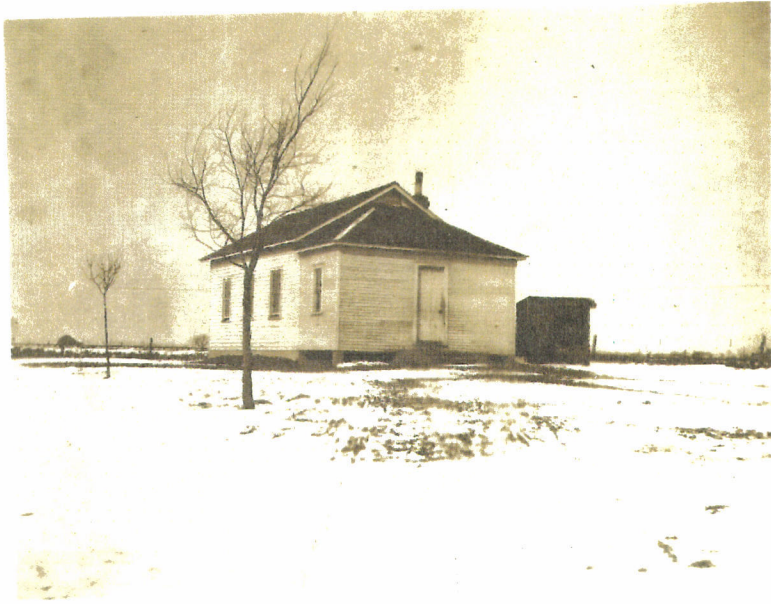
Luken No. 160, Twp. 7-7