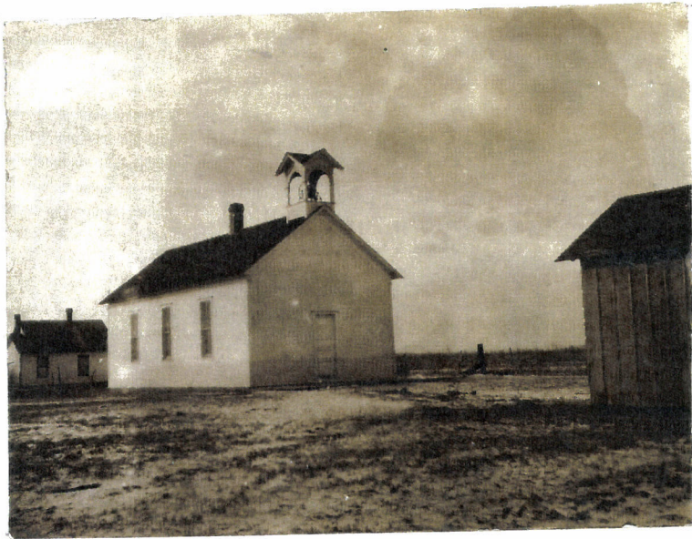
McVey, No. 178, Twp. 11-6.