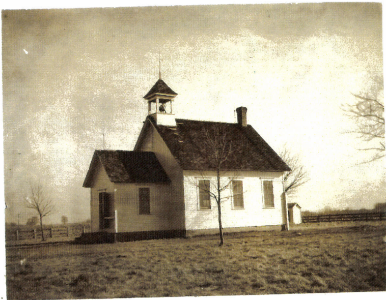
Ruthland, No. 21, Twp. 12-8