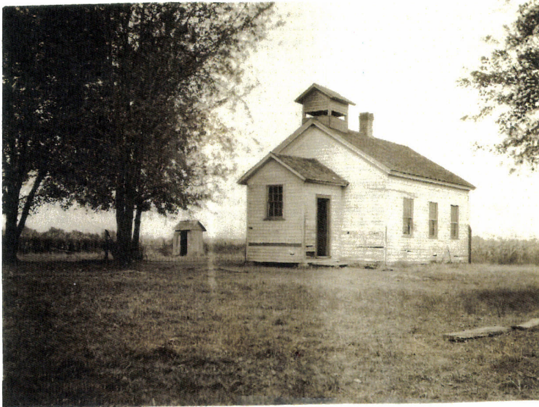
East Union, Dist. 23. Twp. 12-8 1911