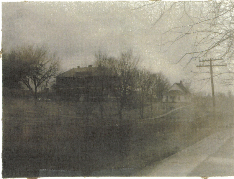
Palmyra, Dist. 25 Twp. 11-8 1911