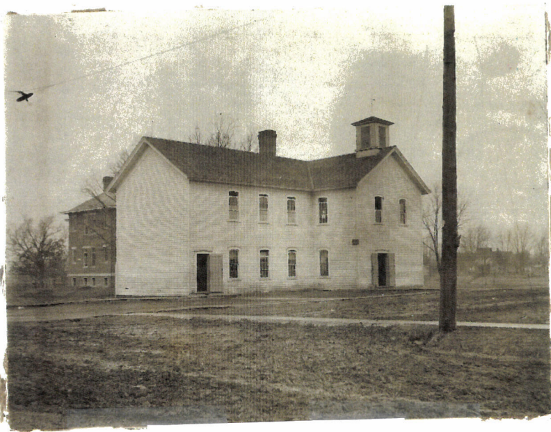
Old School House Palmyra, Dist. 25, Twp. 11-8 1911

No. 9. Dist. 25, Palmyra. (Old building.) Jan. 26, 1911.