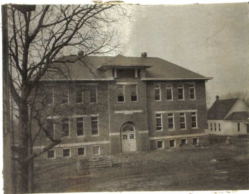
Palmyra Dist. 25. Twp. 11-8. 1911.

No. 9. Dist. 25, Palmyra. (Old building.) Jan. 26, 1911.