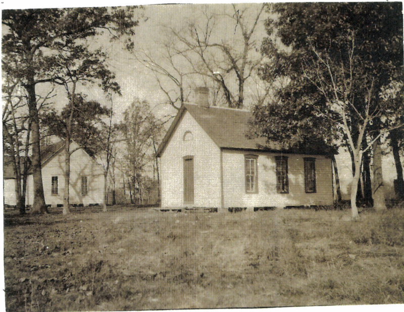
Mt Moriah, No. 30, Twp. 12-9