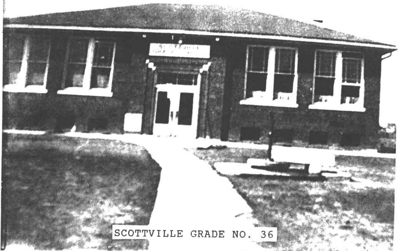
SCOTTVILLE GRADE NO. 36