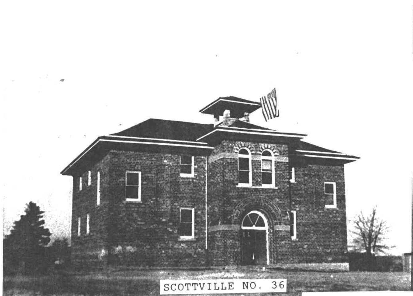
SCOTTVILLE NO. 36