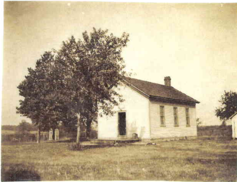
Sunny Point School