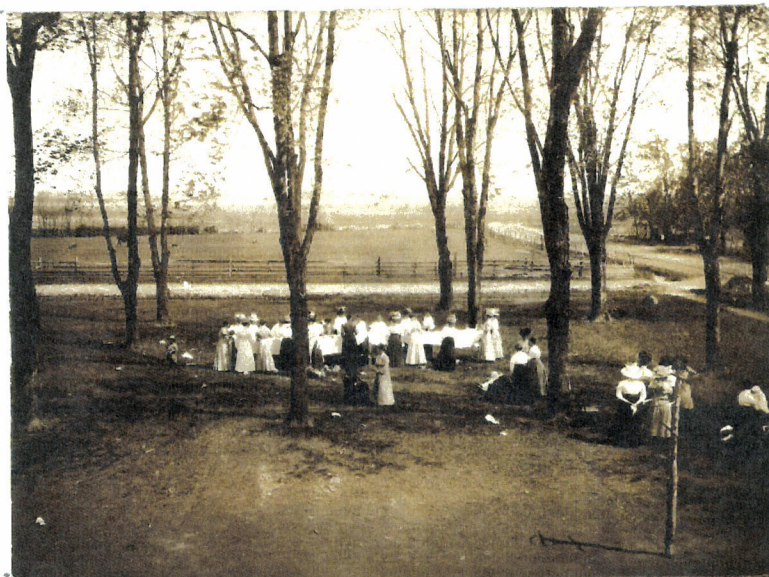
Nilwood School Picnic, May 1912