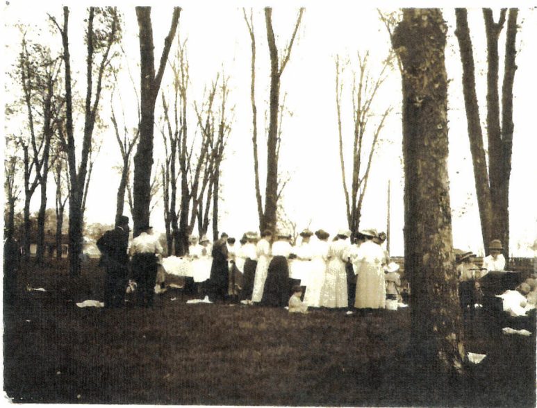
Nilwood, No. 44, Twp. 11-6