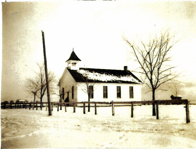
Prairie Chapel, No. 45, 11-7