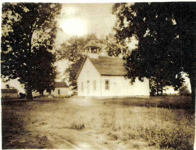
Duncan, No. 56, 11-8