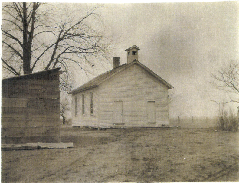
Simpson's Hill, Dist. 58. Prop. 11-8. 1911.

No. 6. Dist. 58, Simpson Hill. Jan. 25, 1911.