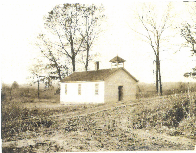
Dresser's Mill No. 59, Twp. 11-8