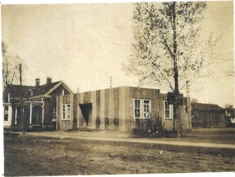
Carlinville, No. 79, Twp. 10-7