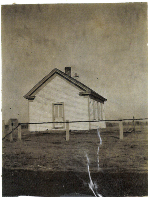
West Fairview, Dist. 86.